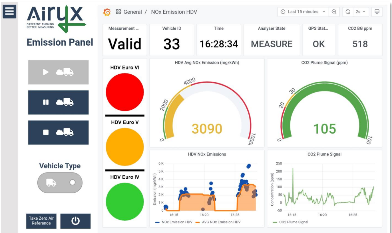
Graphical User Interface for operation and monitoring of Plume Chasing measurements.

The Plume Chasing instrument is operated by a wireless tablet and a simple graphical user interface which enables a data acquisition within a few clicks. Among other details, the user interface provides feedback about the current plume signal strength as well as the assigned emission class (EURO class) . Logfiles are created automatically and are provided for final reports of measured target vehicles.