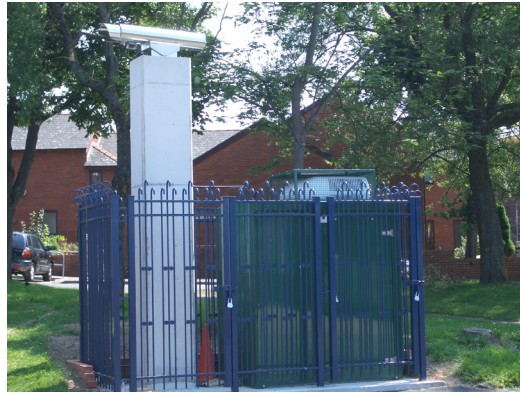
An Opsis open-path DOAS system in Swansea.

One remote-sensing technology particularly well suited for air quality measurement is DOAS (Differential Optical Absorption Spectroscopy) which can be utilised in what we call “open-path” monitoring systems. Open-path DOAS sounds complicated, but really it isn't. A light source (emitter) is projected horizontally over an open-path through the atmosphere to a