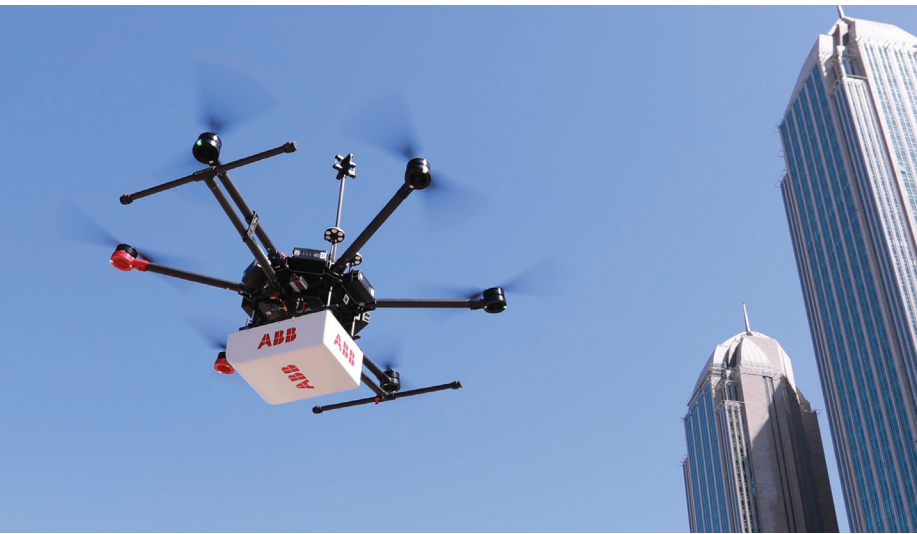
— 01 HoverGuard flying over a city