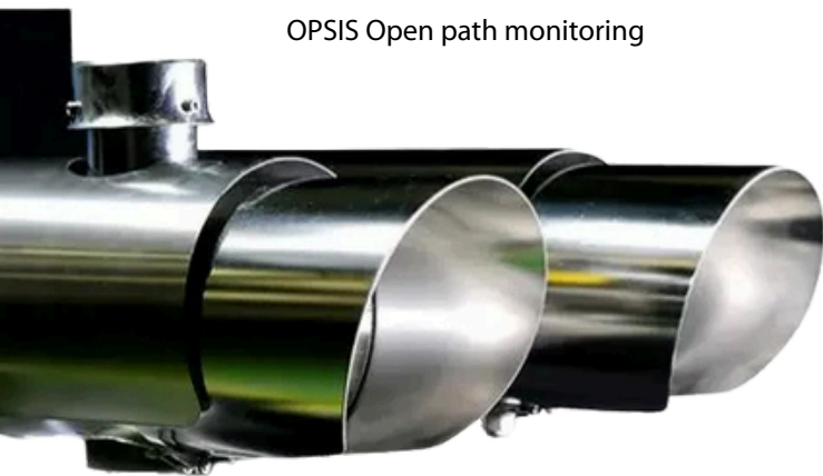
OP SIS Open path monitoring

Automatic long-term sampling of dioxins, furans, and dioxin-like PCBs from flue gases, facilitating compliance with environmental regulations and supporting environmental protection efforts.