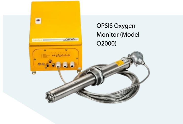
OP SIS Oxygen Monitor (Model O2000)