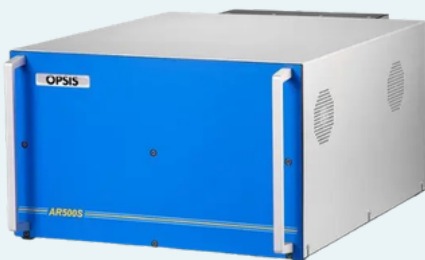
OPSIS System 300

One System – three solutions (cross-duct, hot/wet extractive, fast-loop). Gases include: NO, NO 2 , NH 3 , SO 2 , CO, CO 2 , H 2 O, Hf, HCl, Hg, CH 4 and many more.