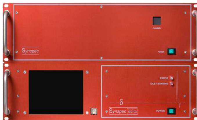
Delta analyzer in combination with a multi channel selector

This automated system continuously measures the required components, has simple software and can provide automatically time-weighted-averages, for example. The system is supplied with flexible software that can communicate with external data loggers using standard industrial protocols. Automated calibration and validation options are also available. Adaptation for Ex safety is possible. The software will fully support the optional Multi (up to 15) Channel Selector (see separate datasheet).