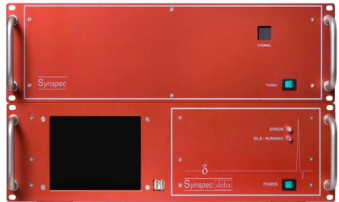
Delta analyzer in combination with a multi channel selector

*Other applications can be supplied on request.